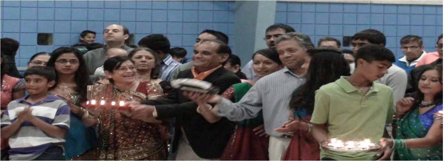
Some photos from Navaratri